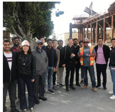
Sixth Street Viaduct construction site