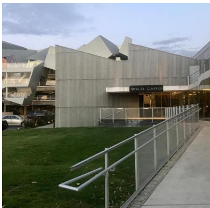
Samitaur Building, Culver City

During a week-long Field Study in Los Angeles, CBIPS Fellows met with city officials, construction industry leaders, architects, engineers and project managers. Seventeen office meetings or site visits were held at locations from the Port of Long Beach to Culver City, and at offices ranging from AECOM to Thornton Tomasetti. Highlights were visits to the new Sixth Street Viaduct construction site and a discussion on the Metro platform with representatives of LA Transit, the Mayor of Culver City, and a local housing developer. Fellows participated in a workshop at USC's Viterbi School of Engineering, meeting colleagues and hearing AECOM senior staff, including former Deputy Mayor Kelli Bernard, discuss how the city was addressing the chronic problem of homelessness. Meetings and site analysis focused on issues regarding buildings, infrastructure, and public space, as well as key issues relating directly to student research.