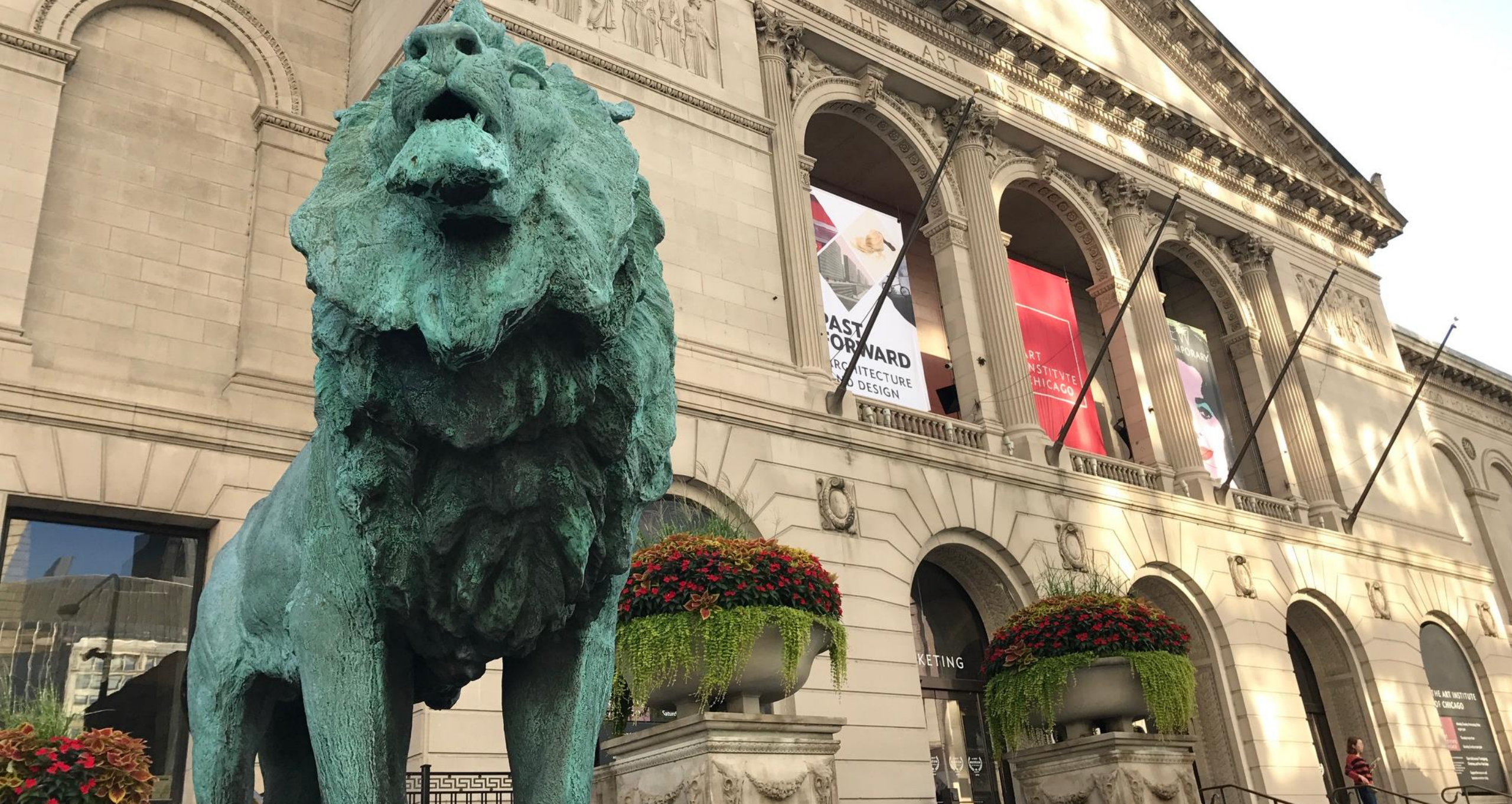
Center for Buildings, Infrastructure and Public Space | Chicago Virtual Field Study | 14 March 2022 – 18 March 2022