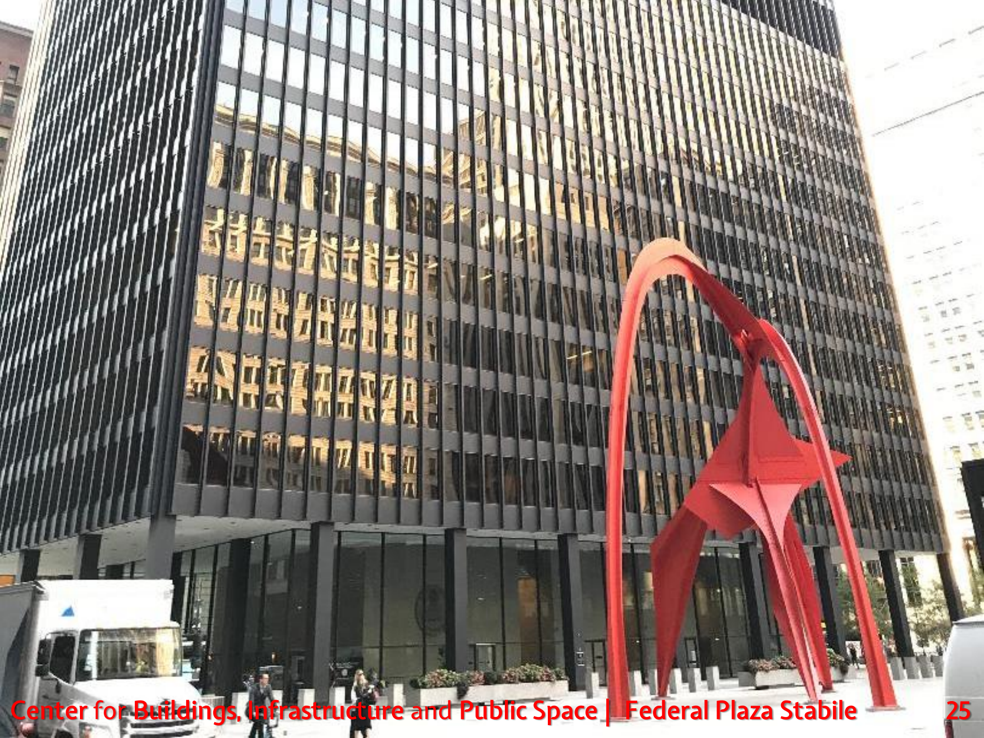
Center for Buildings, Infrastructure and Public Space | Federal Plaza Stabile