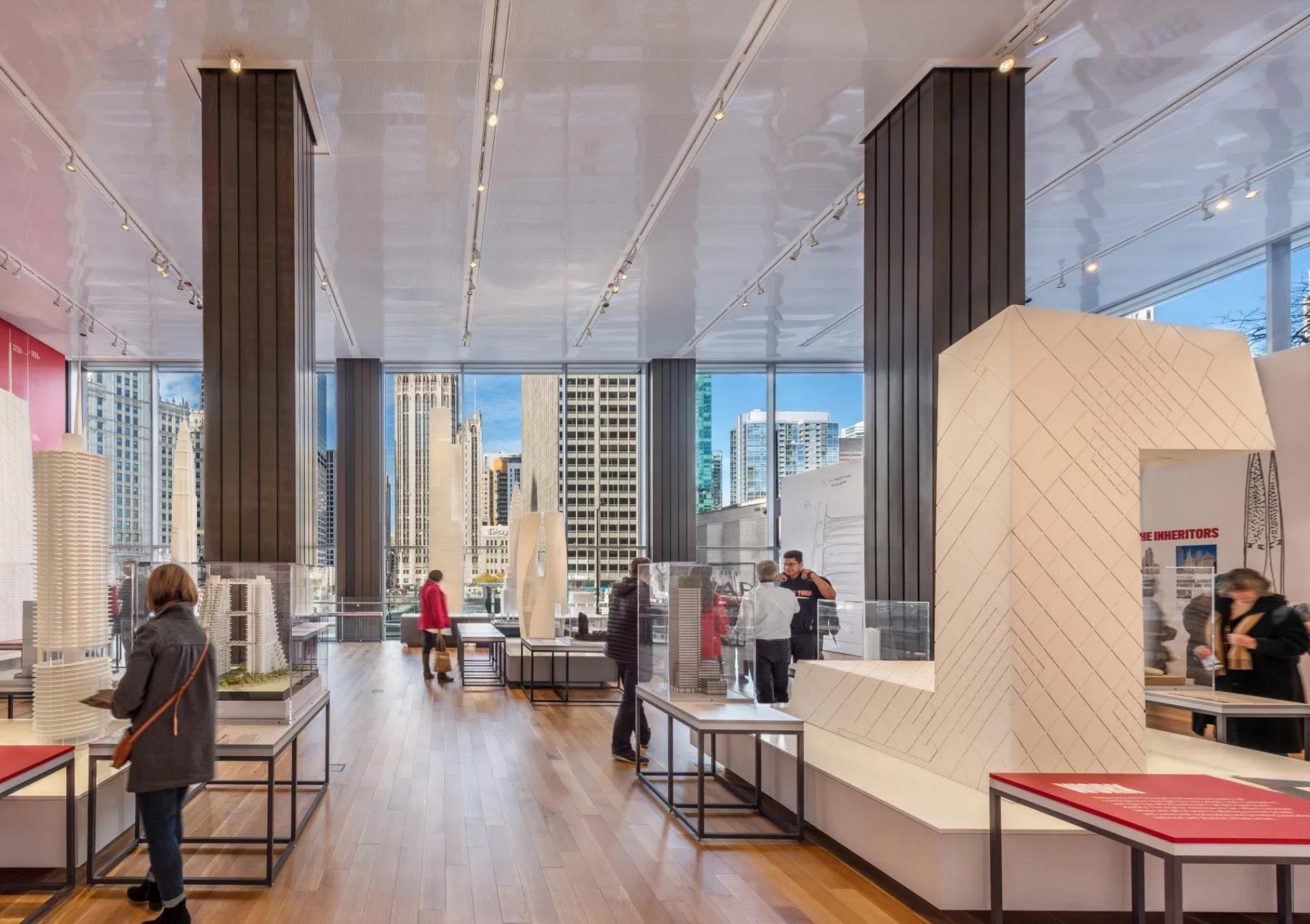
Center for Buildings, Infrastructure and Public Space | Chicago Architecture Center 4