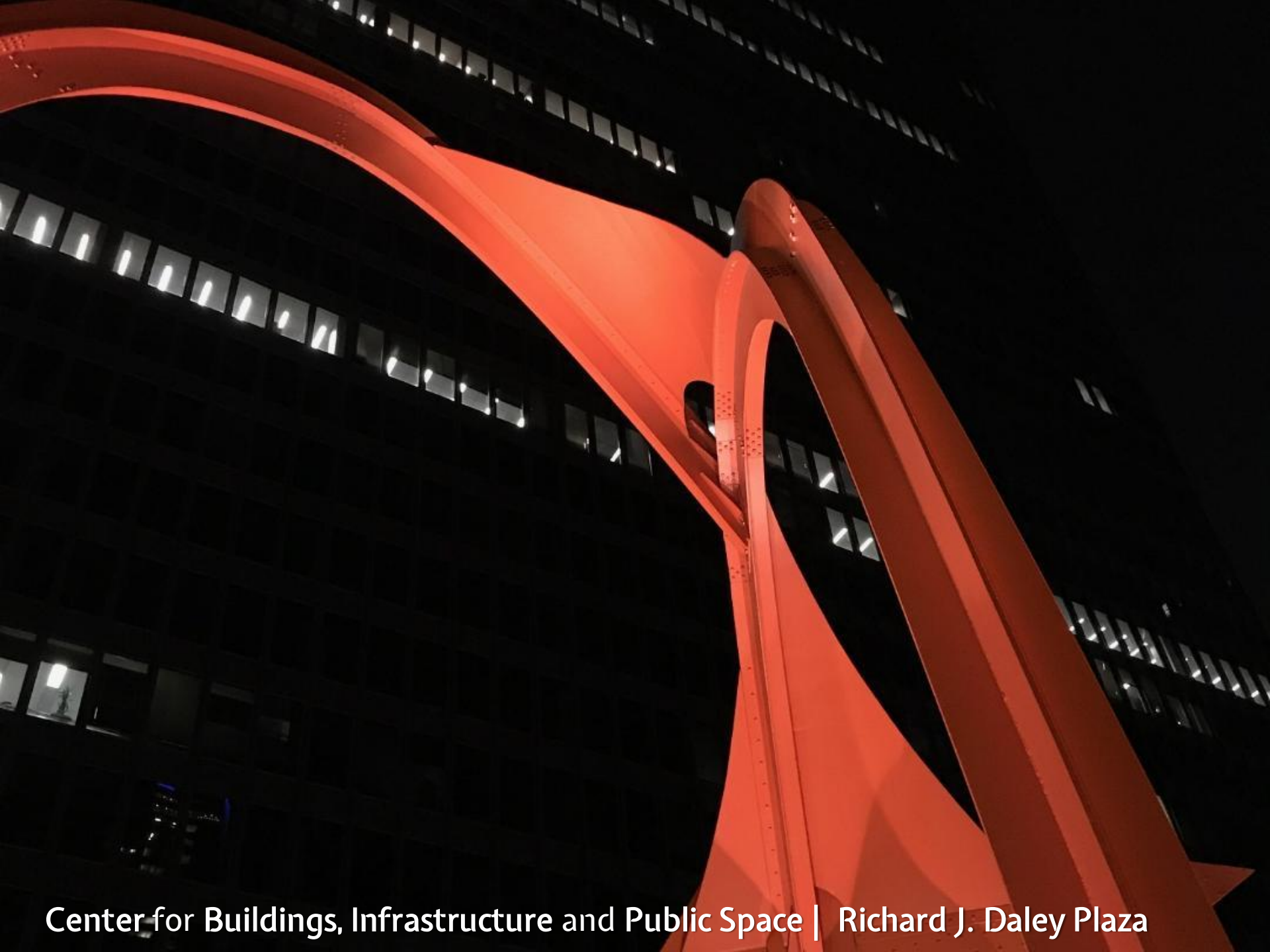
Center for Buildings, Infrastructure and Public Space | Richard J. Daley Plaza