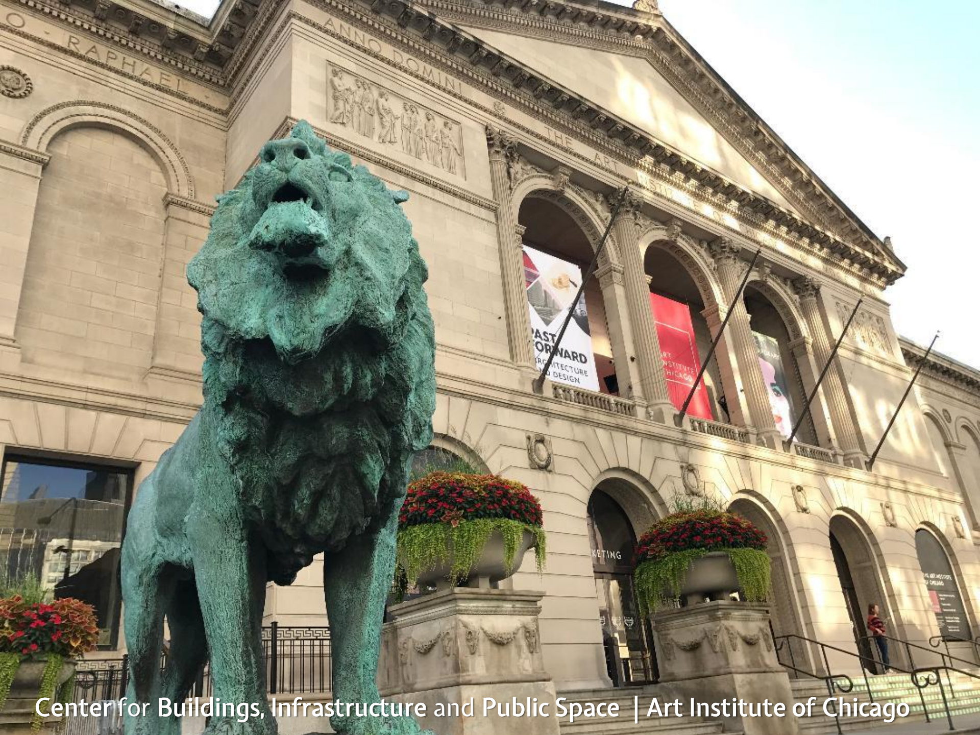
Center for Buildings, Infrastructure and Public Space | Art Institute of Chicago